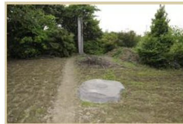
Ruins of Owari Kokubun-ji,

CI: Inazawa-shi Kanko-Kyokai Tel. 0587-22-1414