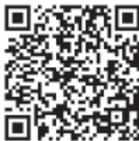
▲National Tax Agency LINE Account