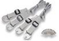
Belts and chains

CI: Bosai-anzen-ka (Crisis Management Division), City Hall Tel.0587-32-1275